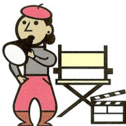
Check our site for details about our director search!

latest announcement. It is expectation that this will be our sole paid employee for 2007 as we fund raise and rehabilitate Fort New Salem.