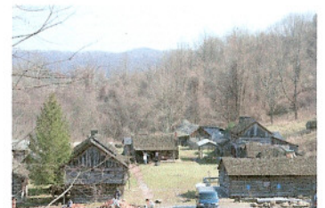
View from the road on a March MMS work day