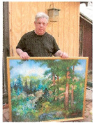
You can view the paintings and information about the silent auction on our website