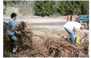
MMS students piling brush.