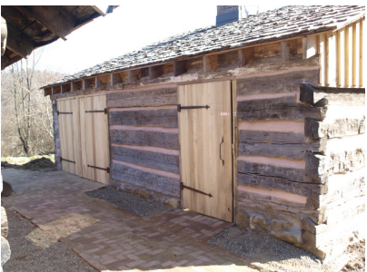
The Blacksmith Shop