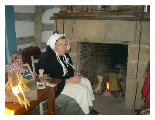
Inside the restored Delilah's Cabin at Spirit of Christmas in the Mountains 2009

We thank the West Virginia Legislature and County Commission for their continued support of Fort New Salem!