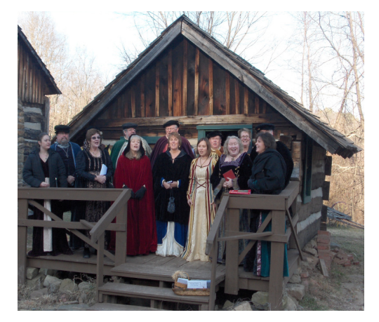
The Clarksburg Madrigals at Spirit of Christmas in the Mountains 2009

Visit http://mastergardeners.ext.wvu.edu/ annual_conference for conference details.