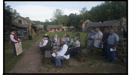
June 27 Celebration details the project

Fund raising is ongoing to finish each structure including HVAC for the REYNOLDS HOUSE and the overall finishing touches for each (electrical work, chinking and daubing, flooring, windows, doors, steps, etc.). We are down to $52,000 needed to finish these two cabins and have them opened and ready to be used for public interpretation. We also have a grant pending for a chimney. Please make your donation today!