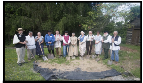
Ground breaking for new site