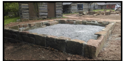
New foundation for BLOCK HOUSE