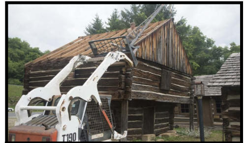
Taking down the BLOCK HOUSE