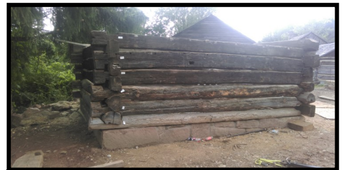
Restacking the BLOCK HOUSE first floor