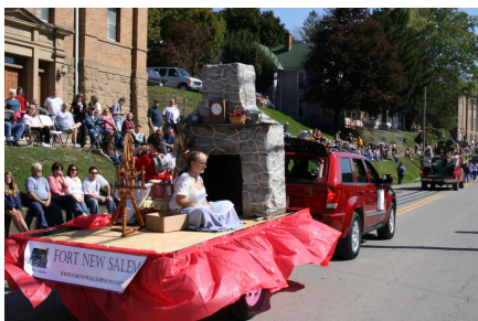
Our Float in the 2010 Apple Butter Parade