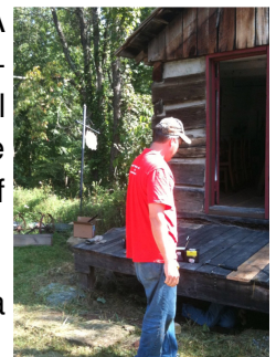
A West Union Bank Volunteer at Tin Smith Shop

Our final grand opening is the “Tin Smith Shop”. The work on this structure was completed with the support in funding and labor by the West Union Bank . It has a freshly completed deck with roof.