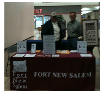
Magical Night To Give Fund raising event at Meadowbrook Mall