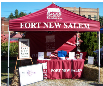
Our new canopy in use at the Salem Apple Butter festival

At a volunteer day, representatives of the media were amazed how much work has been accomplished this year in spite of the long and rough winter weather we all faced. While we were complimented, we also took a hard look at our grounds. Call us a building site, a construction zone or a work in progress, regardless we were less than pleasing to the eye. As such we commissioned work to remove our old split rail fencing and replaced it with a stacked split rail that provides an attractive barrier between the parking lot and our main campus. Additionally, we built a temporary fence around the area we use to store work materials. When you next visit, I am sure you will agree it has a major impact on our appearance.