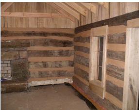
Interior of the Weaving Room

During Spirit of Christmas, we will proudly dedicate the reopening of three more cabins! These will be on Sunday, December 5 at 4 PM.