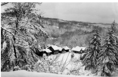
Winter scene of the Fort