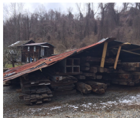
The Reynolds House is stacked in our parking lot.