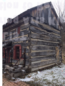
The Green Tree in shown in its current condition.

Recently we kicked off the "RESHAPE THE FUTURE" campaign that will change the appearance and future of Fort New Salem. We are pleased to announce that the Reynolds House is now on our campus. We also have purchased a storage trailer to assist in temporary placement of some cabin contents. All is moving forward on our major work of reconstructing the Reynolds House and the restoration, rehabilitation and reopening of the Green Tree Tavern. If every recipient of our newsletter who has not already done so, donated $400, our campaign will be a success and our work will be done by years end. We are appreciative of those who have already donated.