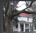
Reynolds House Construction